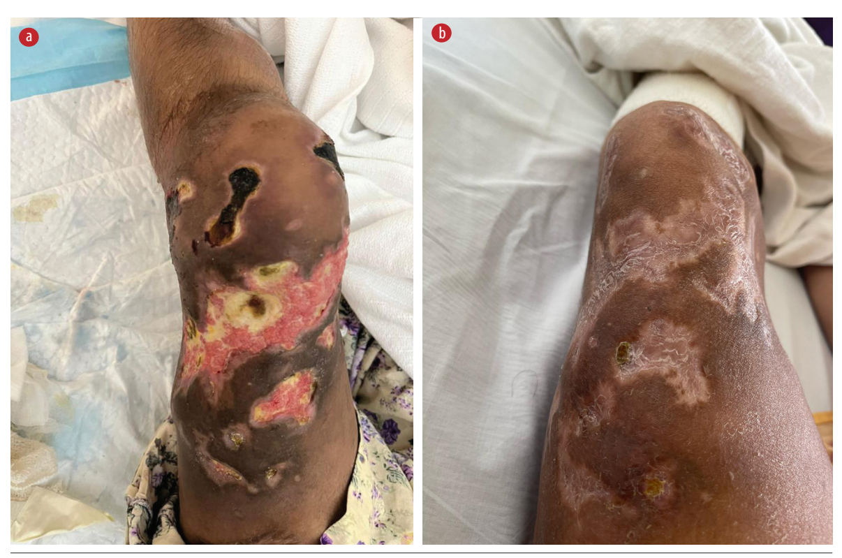
Figure 2: (a) Advanced lesions have formed with evidence of granulation. (b) The lesions after healing.

cultures grew pseudomonas bacteria. The trials to insert cannulas for intravenous (IV) antibiotics again caused a formation of bulla followed by ulcerations. The patient refused any further trials,