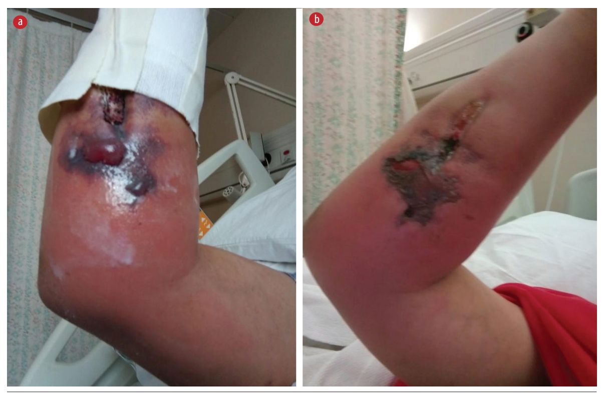
Figure 1: (a) Post-cannulation with superficial bulla. (b) The bulla has progressed to ulceration.